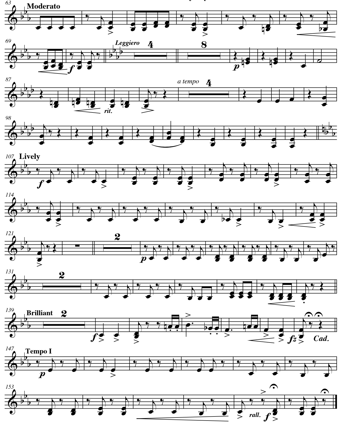
Stars in a Velvety Sky