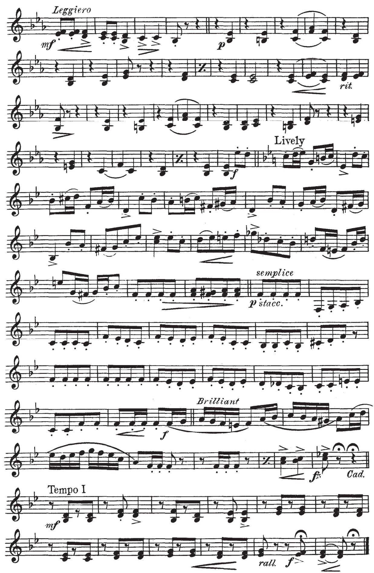
2<sup>nd</sup> & 3<sup>rd</sup> Bb Clarinets