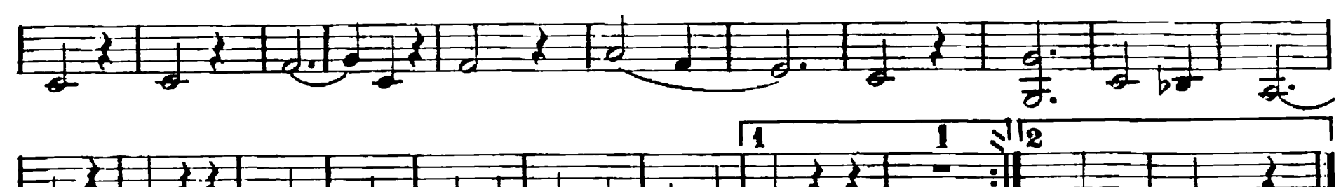
Jack Mills Inc. 148-150 W. 46th St. New York